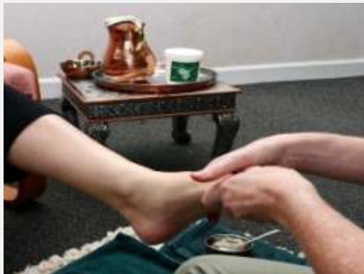
Signature Abhyanga Massage