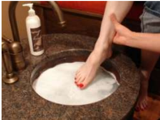
Spray Hydrosol Soak & Groom