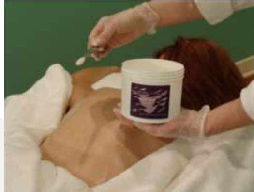
Sprinkle on Exfoliant over Mask