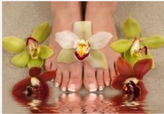
Clean Nail & Polish