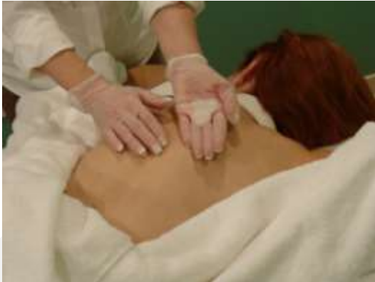
Apply Dual Mask