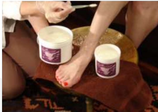
Exfoliate & Mask & Spray Hydrosol