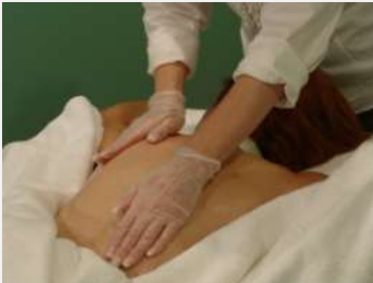
Exfoliation Massage Spray Hydrosol