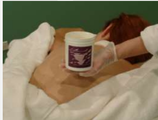
Apply more Dual Mask if needed for rehydration of the skin

All 3 Collections are designed for Body Glows and Wraps!